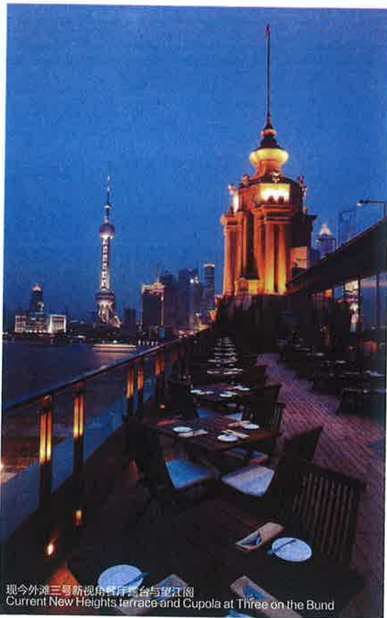
现今外滩三号新视角餐厅露台与望江阁 Current New Heights terrace and Cupola at Three on the Bund