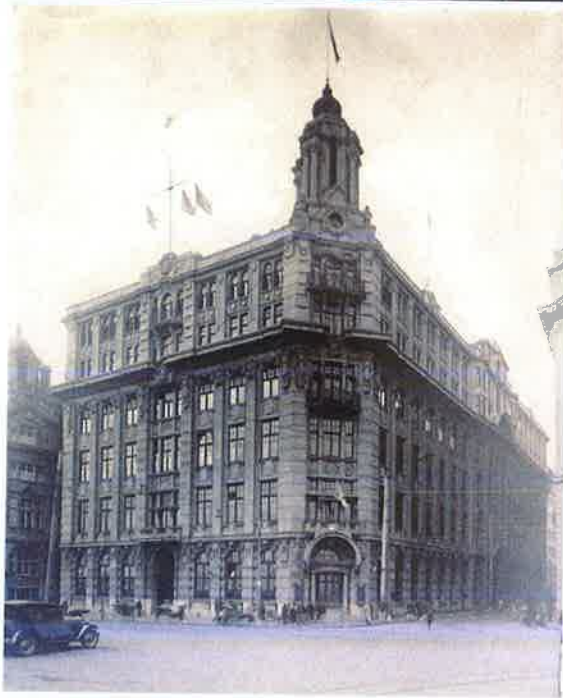
始建于1916年的外滩三号大楼最初为英国有利银行大厦 In 1916, The Union Building, located at No. 3, the Bund was erected in majestic Neo-Renaissance Style

Thirteen years ago, when the House of Three invested in and renovated The Union Building, it seemed to hint that a new way of life was emerging in Shanghai. Just like Ronan. J.Henaff, COO of Three On The Bund, said "for many it is one of the pioneering founders of the modern Bund. It embodies refinement, culture and gastronomy, and its establishment was the start of a wave that transformed the Bund area from a tourist attraction to an upmarket destination for indulging in art and fine dining."